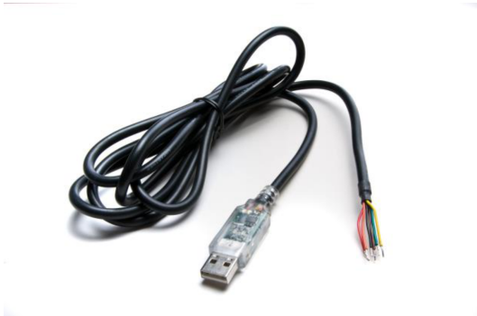
FTDI USB-RS485 Cable

The ZT-100-C can be connected to a PC using an FTDI USB-RS485 cable for configuration and monitoring via the ZT-100-C Interface application.